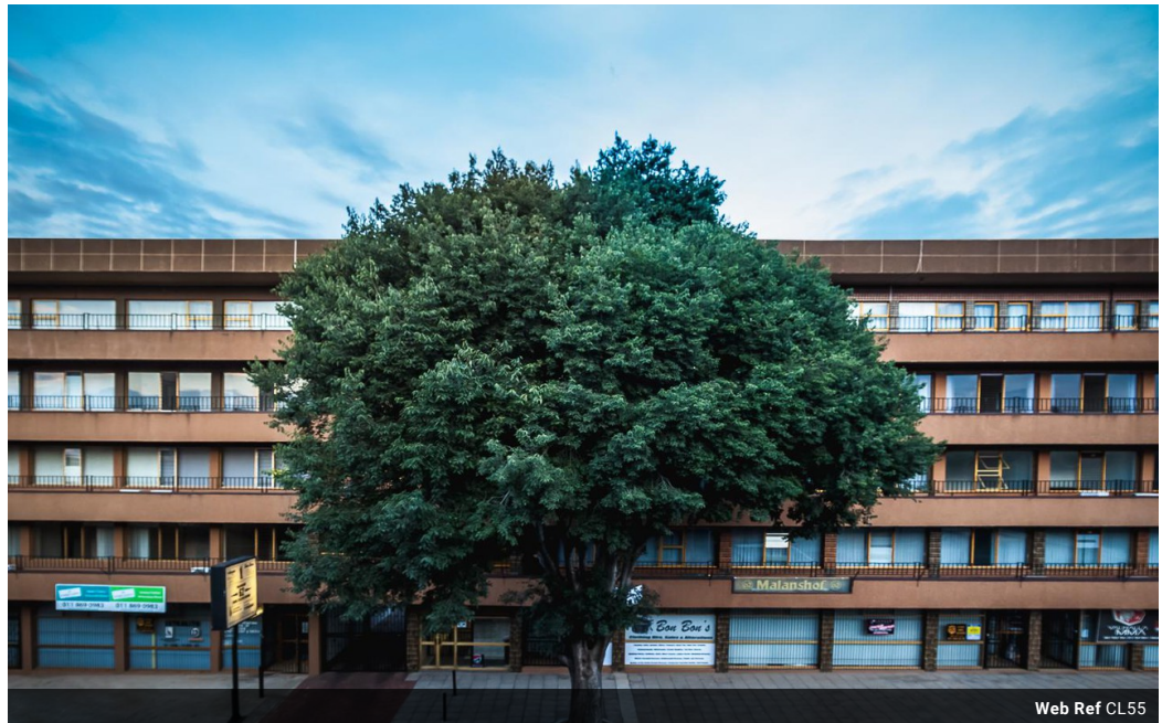
Web Ref CL55

56 Hennie Alberts Street Brackenhurst Alberton 1448