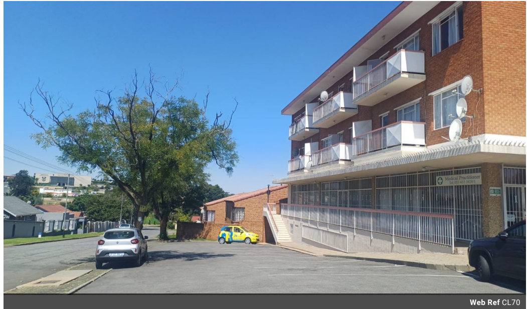
Web Ref CL70

56 Hennie Alberts Street Brackenhurst Alberton 1448